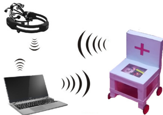
Figure 3.2 Procedure

A brain-computer interface (BCI) is a direct communication pathway between the brain and an external device. BCIs are often directed at assisting, augmenting, or repairing human cognitive or sensory-motor functions the long-term objective of this research is to create a multi-position, brain-controlled switch that is activated by signals measured directly from an individual's brain. We believe that such a switch will allow an individual with a severe disability to have effective control of devices such as assistive appliances, computers, and neural prostheses in natural environments. This type of direct-brain interface would increase an individual's independence, leading to a